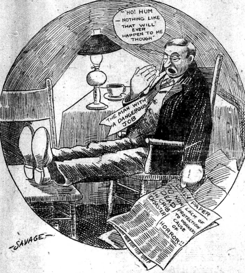
AND DEMAND PROPER PROTECTION?