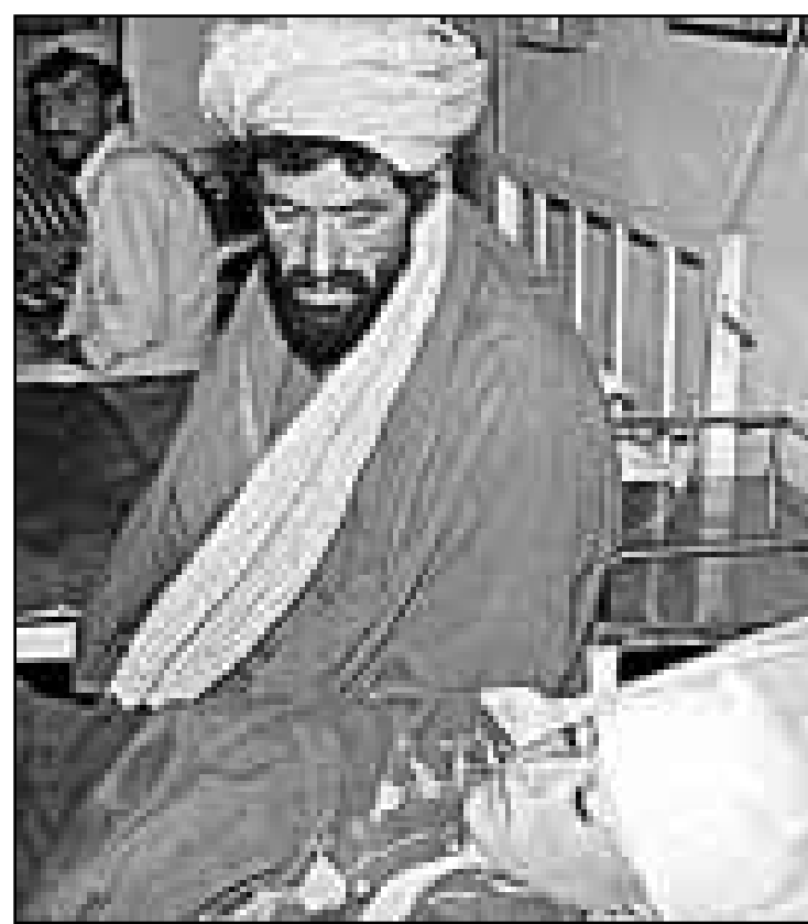
Victims of smart bombing