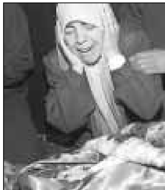
Mourning a victim of Israel