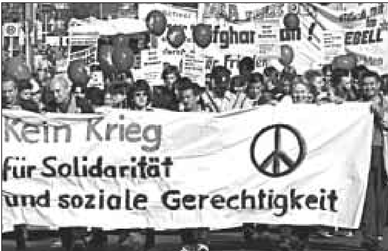
Anti war protest in Germany For more on the anti war movement turn to page 6

This offers the best hope of stopping the horrors that Bush has in store for the world.